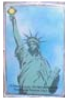
Lady Liberty put down her torch to hold up a condom.