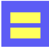
HRC supporters often display its logo.

The following corporations funded HRC’s 2005 National Dinner (known supporters of Planned Parenthood are in italic ): Volvo, Capital One, Microsoft , the Government of Canada, Satellite Radio, Chevron, Corning, Ernst & Young , the National Education Association (NEA), Northrop Grumman, MGM Mirage, Motorola, America Online (owned by Time Warner ; also sponsored a table), Bank of America , the American Association of Retired Persons (AARP), Hyatt (hotels & resorts), Merrill Lynch, Providian (financial services), SunTrust (financial services), Witeck-Combs Communications, & Aramark (food service). The Hershey Company and International Business Machines (IBM) sponsored tables. Incidentally, NARAL Pro-Choice America and EMILY’S List each sponsored tables.