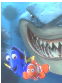
“Finding Nemo” found a big audience.

The Walt Disney Company has agreed to acquire Pixar Animation Studios. Pixar has had a long working relationship with Disney, but the agreement will make the leader in computer animation a subsidiary of the much larger Walt Disney Company. Pixar is responsible for such film hits as “Toy Story,” “A Bug’s Life,” “Finding Nemo,” “Cars,” “Monsters Inc.,” and “The Incredibles.”