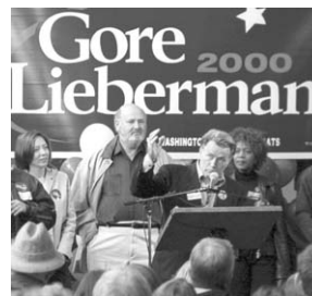
Sheen campaigned for pro-abortion Al Gore.

Being pragmatic rather than didactic does not make one “pro-choice.” It simply allows one to craft real-world solutions that have an actual chance of saving babies.