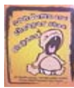
“Condoms are cheaper than diapers.”