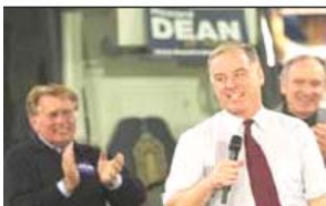
Sheen enthusiastically worked for pro-abortion Howard Dean.

Sheen: I don’t really have a great deal of confidence in politics or politicians, but there are certain elected officials that I admire very much, such as Dennis Kucinich from Ohio, Barbara Lee, Congresswoman from Oakland, Howard Dean, who I’m supporting for President.