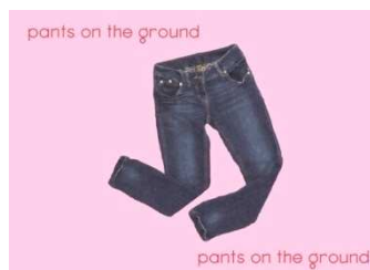
Front: “pants on the ground” Inside: “I always stay safe with my pants on the ground.”