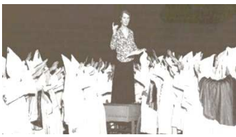
Sanger speaks to the Women Knights of the Ku Klux Klan in Silver Lake, N.J.

The Planned Parenthood Federation of America (PPFA) awards a “Maggie” (named in honor of Planned Parenthood founder and eugenics backer Margaret Higgins Sanger) to people in the media, arts and enter-