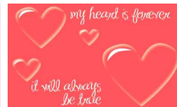
Front: “my heart is forever...it will always be true” Inside: “That’s why I want to stay safe and sexy with you.”