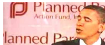
What Planned Parenthood wants, Planned Parenthood gets.