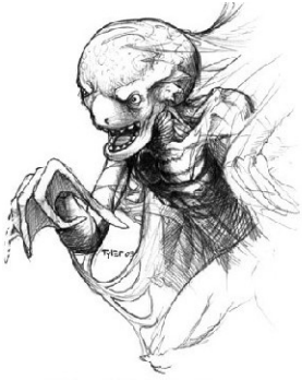
Police artist sketch of pregnancy care center worker—as described by abortion advocates.

The pregnant woman continues to make it sound as though the pregnancy help center was a dangerous place, even describing the volunteers as “downright creepy.” What? Did they have three eyes and four arms? Did they appear in horror movies before saying to themselves, “You know, this movie career is great,