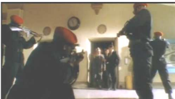
The music video for “By the Time I Get to Arizona” shows members of Public Enemy assassinating lawmakers who opposed the holiday.

In 1983, bowing to political pressure and a certain veto override, President Ronald W. Reagan signed a bill establishing a new federal holiday—Martin Luther King, Jr. Day. Activists demanded that every legislature create a state holiday as well. Most quickly did so, but Arizona balked. In 1990, the issue was put to the people of Arizona and they voted against creating the holiday.