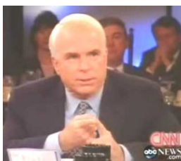
McCain sought to add a rape/incest exception to the Republican Platform.

I hope others will use caution before they decide to split the coalition for life over political vendettas [sic].