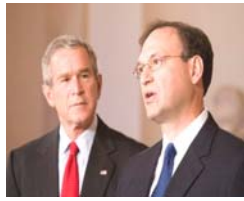
Alito speaks to the press after President Bush announced his nomination.

The most recent nominee for a position on the nine-member U.S. Supreme Court is Samuel Alito who currently serves as a judge on the U.S. Court of Appeals for the Third Circuit. Alito was nominated to the Supreme Court by President George W. Bush after Harriet Miers withdrew her name from consideration.