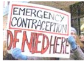
Planned Parenthood activists picket a drug store.