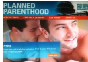
Planned Parenthood’s website “celebrates” homosexuality.

I just feel really sad for you. I have two dads, like the boy in the video, and all the ignorance about families like mine just makes me feel discouraged. This is 2009, but I guess you’d never know it. There’s nothing wrong with being gay. Gay people are the same as straight people, and anyone else’s sex life is really none of your business. You’re obsessed with it and fixated on it. It says more about you than it does about gay people.