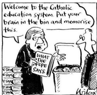
A display of bigotry from the "Something Leftish" blog.

Service to the integrity and well-being of the individual is the ideal that must constantly guide the Catholic pharmacist. As he exercises his profession, he should be inspired by the example of "Jesus of Nazareth, who went about doing good and healing" (Acts 10:38) all those who approached him. Thus the pharmacist should be concerned with "relieving suffering, improving treatment and curing men's ailments", conscious that where there is life, there is the Spirit of God who is our Creator and Consolar.