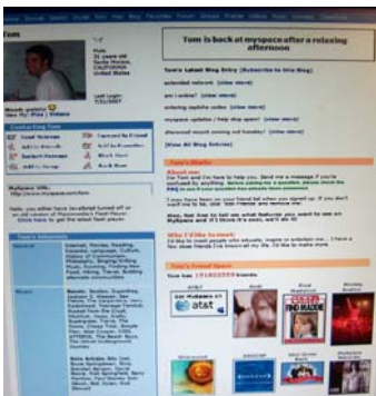
MySpace is one of the most popular websites, especially among young people.

One popular MySpace feature is an internal search engine that allows members to find others based on various criteria. For example, a member may search for another MySpace user by typing in a name, school, job type, age range, city, gender, marital status, sexual orientation, and so forth.