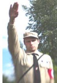
Would Wells Fargo get away with supporting white supremacist groups?

ports the organization's goals and activities. But is it possible to give money or product without taking such a position? Can a corporation give money or product and divorce itself from the group's goals and activities? Can a corporation give money or product and take no responsibility for the group's advancement or the success of a stated agenda?