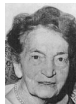
Sanger: "Hitler in a skirt."

The next section of PPFA's Annual Report is headed, "Planned Parenthood: Providing Trusted Health Care Services." An introduction references PPFA's elitist and racist founder. "From the 450 women who crowded into Margaret Sanger's first clinic, the number of women, men, and teenagers Planned Parenthood affiliate health centers serve has steadily grown to more than three million a year—totaling about 30 million since 1916." Never particularly good at math, except when it comes to counting money, PPFA goes on to claim that, "One in four American women has turned to Planned Parenthood for health care at least once in her life."