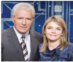
Alex Trebek & Kathryn Erbe at a PPFA event.

prevent unintended pregnancies through effective family planning programs, and protect the health of young people through comprehensive sexuality education.